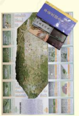
Heian-kyo guide map set on sale at Kyoto City Heiankyo Sosei-Kan Museum for 1300 (tax included)

This ancient Kyoto map set - comprising the layout of the Heian-kyo reconstruction model, the walking guide to historical remains and the guide to the Tale of Genji - guides you through historical remnants, explains the points of interest in the Heian-kyo reconstruction model and decodes the complexities of the Tale of Genji. Hence, this map set is what you need to make your visit more informative.